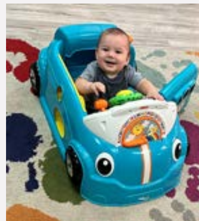
“The happiest baby ever”