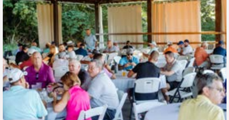
Full house! Golfers enjoyed lunch from Izzy's and dinner from Texas Roadhouse of Fort Wright.

Golf “Fore” Fathers supports our Fatherhood education program and other parenting classes.