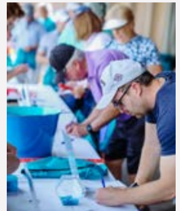
(Left) One of our co-ed teams. Men who purchased a Skirts ticket were allowed to hit from the women's tee on Hole 5. (Right) Golfers get serious about our raffles and silent auction.