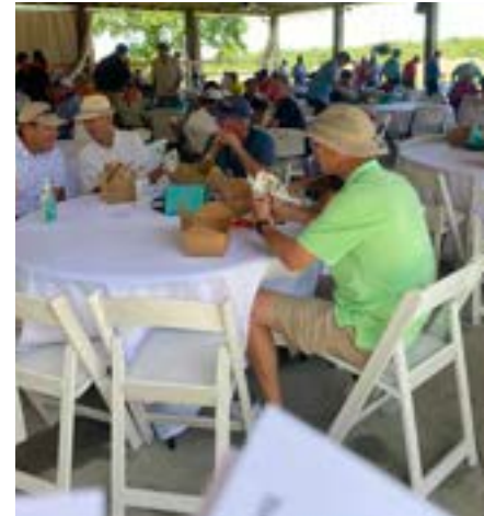
Lunch from Izzy's before heading out.

See hole, silent auction and raffle sponsors at carenetky.org .