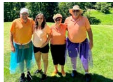
We welcomed not only the most fun golfers but also the most stylish.