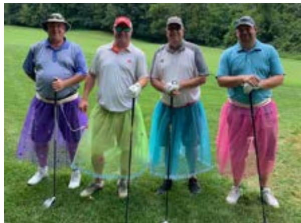
Golfers can pay $5 to hit from the women's tee on Hole 5—always a favorite and always great fun!