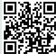
Host a table

Our banquet happens because friends of Care Net who stand for life invite their friends to learn about our ministry. Vital to the banquet’s success are table hosts, who agree to fill a table of 10. The banquet is our most important fundraiser and donations are requested. Scan the code at right if you’d like to host a table.